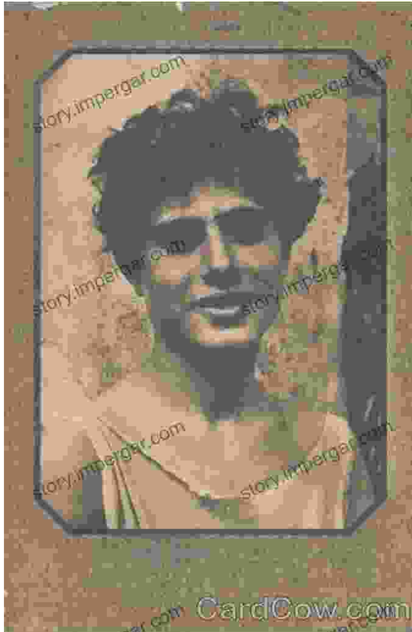
A portrait of a local woman in Saint Martin