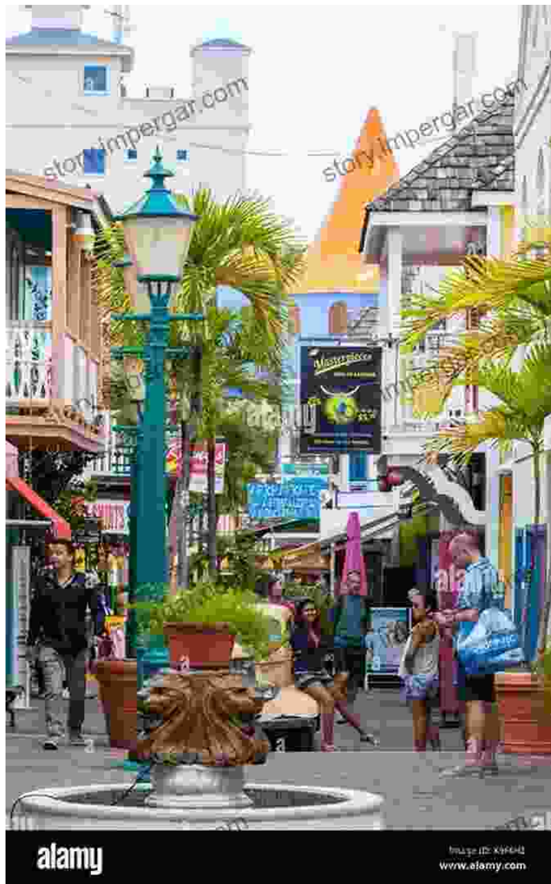
A vibrant street scene in Sint Maarten