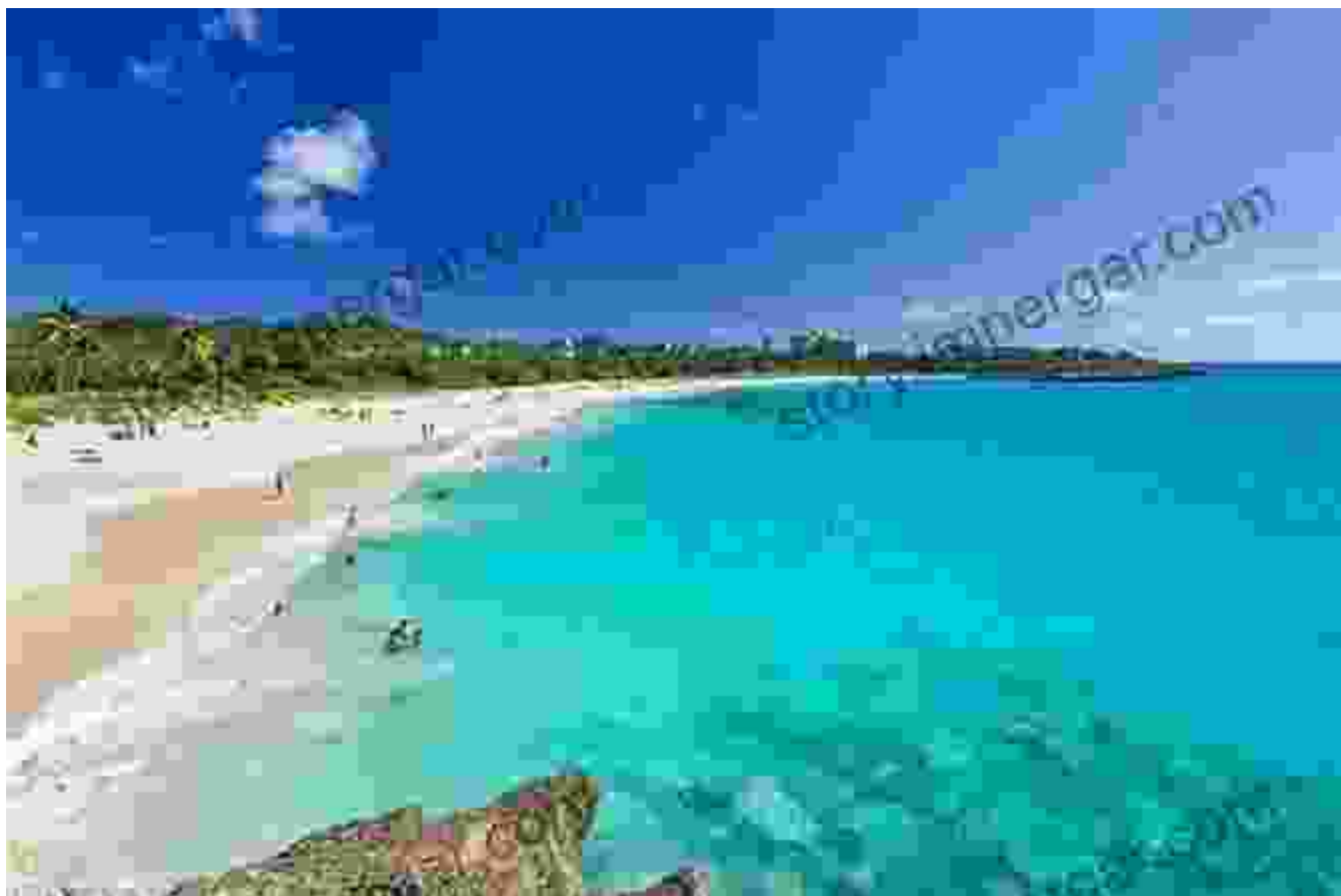
A beautiful beach in Sint Maarten

https://www.Our Book Library.com/Sint-Maarten-Saint-Martin-Photographer/dp/1530092289