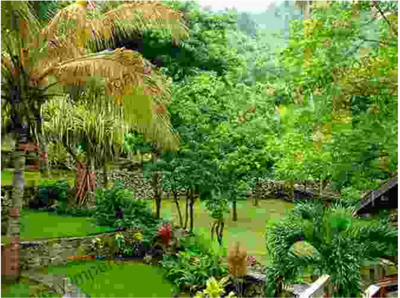
A lush rainforest in Saint Martin