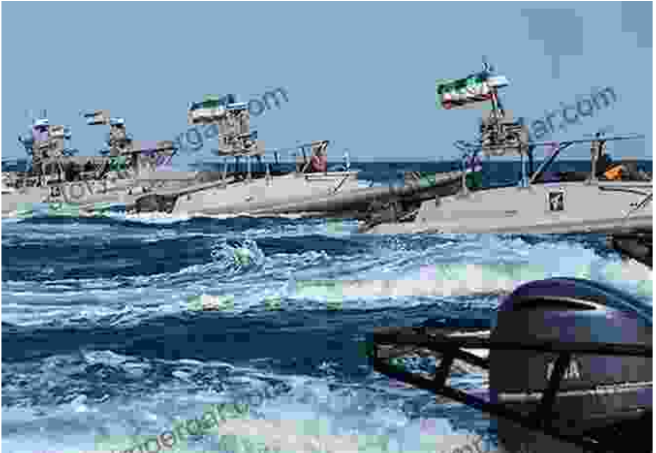
IRGC Navy ship in the Persian Gulf